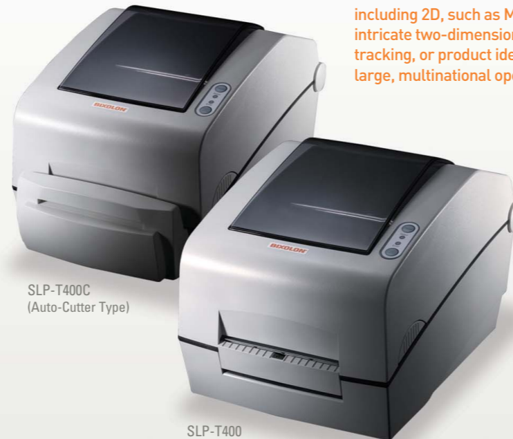
SLP-T400C (Auto-Cutter Type)