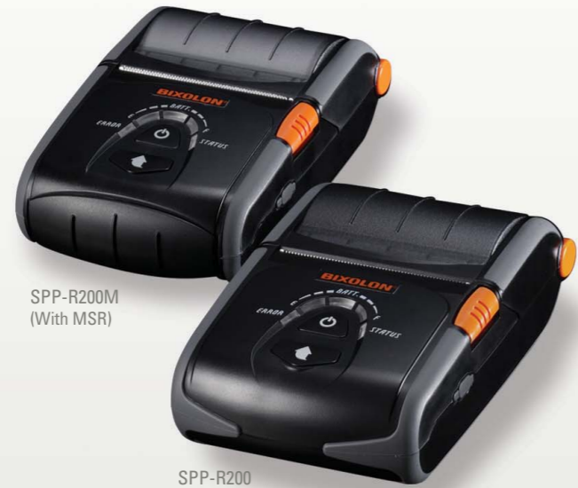
SPP-R200M (With MSR)

Intuitive wireless capability, long battery life and handheld size that suits perfectly on a belt strap or leather case, the Compact yet Rugged, Mobil Printer SPP-R200 fully satisfies the anytime and anywhere demands of today's mobile commerce.