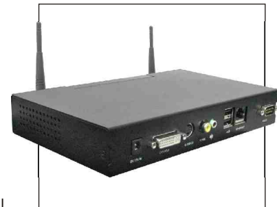
WLAN ,RS232 (optional)

* Note: this is a simplified drawing and some components are not marked in detail. Please contact our sales representative if you need further product information.